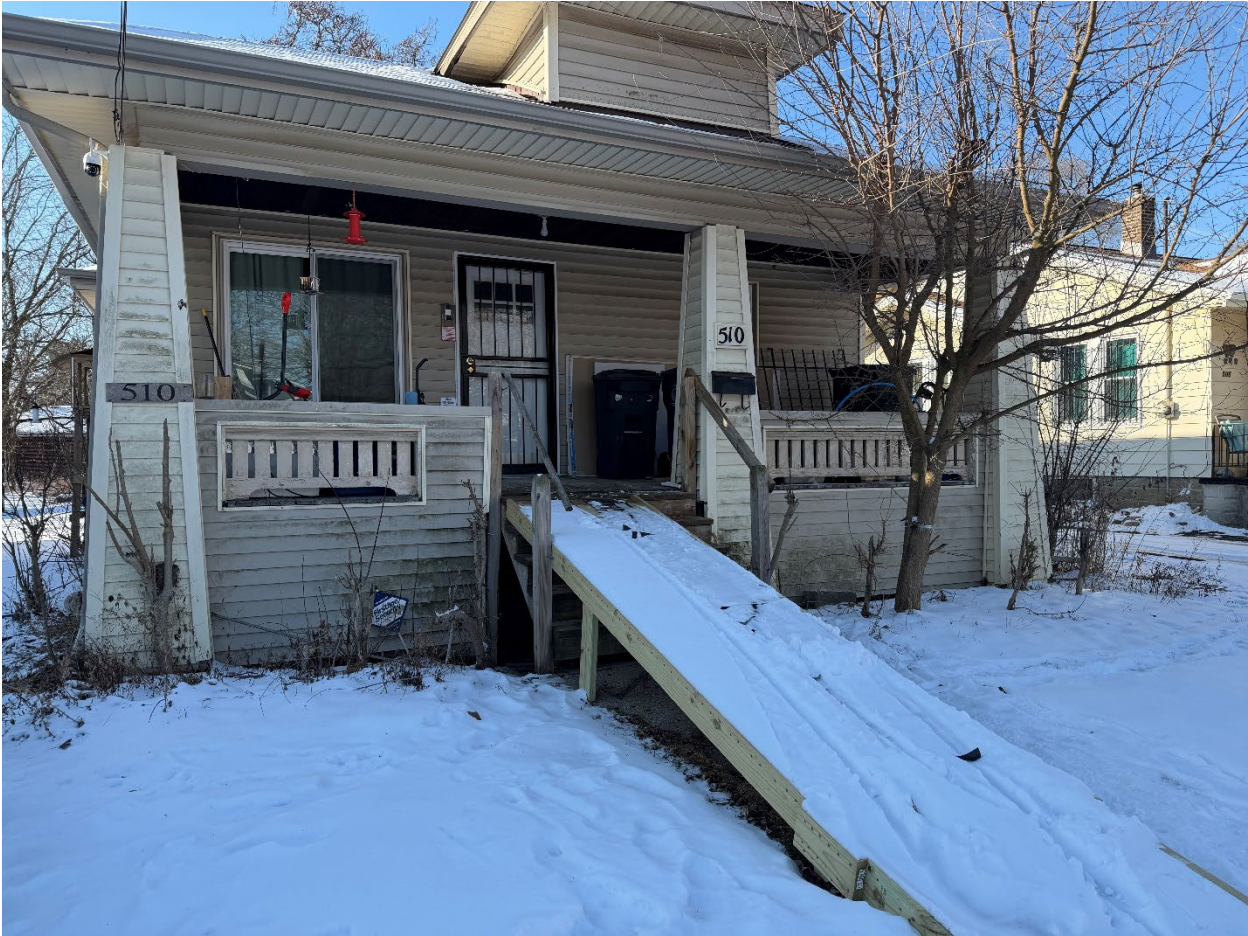
Redacted Photos 2