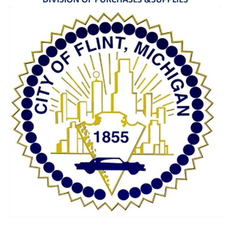
Sheldon A. Neeley, Mayor